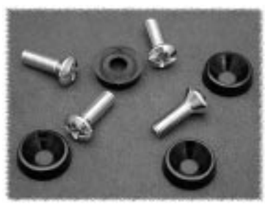
Part #: 1421A (package of 4 screws & 4 plastic cup washers)