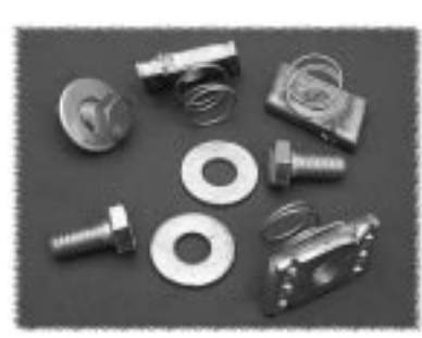
Part #: 1463S (package of 3 bolts, spring nuts & washers)