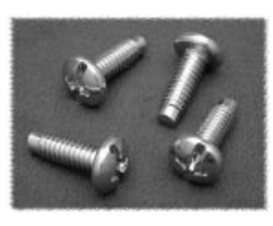
Part #: H1224S20 (package of 20 screws)