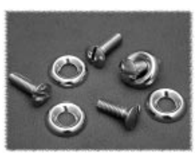
Part #: 1421 (package of 4 screws & 4 metal cup washers)