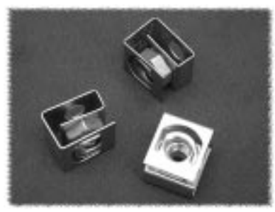
Part #: 1421NP25 (package of 25) Part #: 1421NP100 (package of 100)