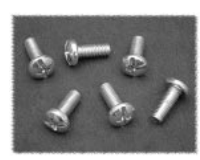
Part #: 1421D (package of 25)