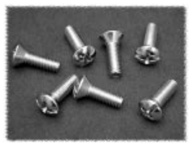
Part #: 1421A25B (package of 25) Part #: 1421A100B (package of 100)