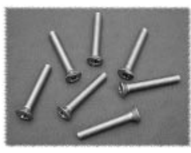
Part #: 1421F25 (package of 25)