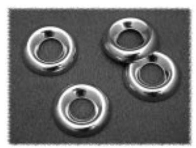
Part #: 1421E25W (package of 25) Part #: 1421E100W (package of 100)