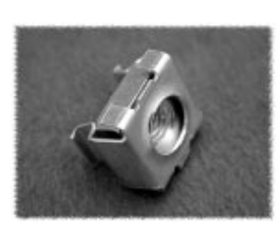
Part #: 1421CNB25 (package of 25) Part #: 1421CNB100 (package of 100)