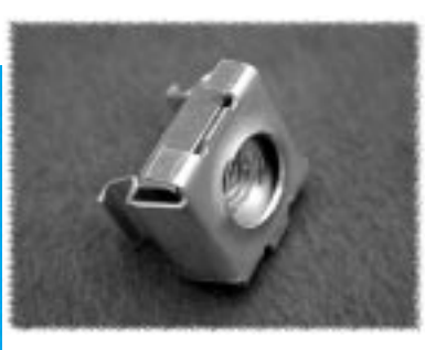
Part #: 1421CNA25 (package of 25) Part #: 1421CNA100 (package of 100)