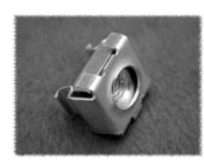
Part #: 1421CNC25 (package of 25) Part #: 1421CNC100 (package of 100)