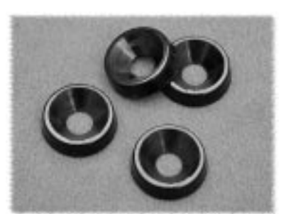
Part #: 1421A25W (package of 25) Part #: 1421A100W (package of 100)