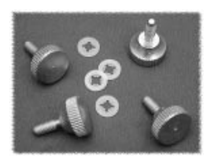
Part #: 1421B (package of 4 screws & 4 nylon washers)